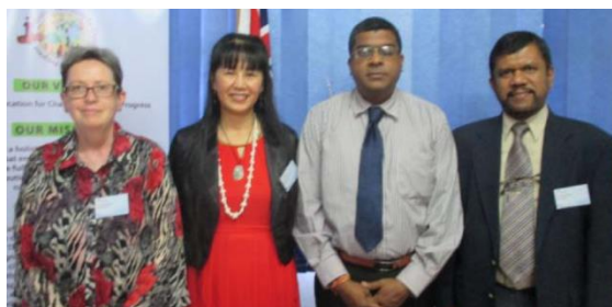
The Minister of Education in Fiji met the APQR Review Panel