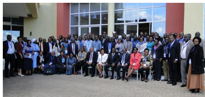
EAQAN Forum, 7-10 May 2018, Kigali, Rwanda

EAQAN is a network of quality assurance practitioners in the East African Community. The Network was formally established in 2012 and since then holds a quality assurance forum in May every year. The event attracts more than 150 participants from the region and beyond. These are drawn from the more than 130 member Universities of the Inter-University Council for East Africa (IUCEA). The annual forum, organized with the support of IUCEA, brings together stakeholders in higher education, and quality assurance in particular, to share on common themes related to quality and higher education in East Africa. The stakeholders usually include policy and decision makers in the region and beyond. The forum provides an opportunity for EAQAN members to present papers and share best practices and experiences on key issues of quality assurance, quality enhancement and networking opportunity with other QA practitioners regionally and internationally.