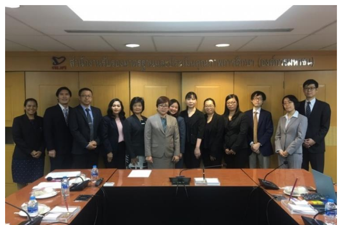
The staff of JUAA and TWAEA attended the interagency seminar of exchange hosted by the Thai Office for National Education Standards and Quality Assessment (ONESQA)

In addition, the International Joint Accreditation Project, TWAEA, JUAA and the Thai Office for National Education Standards and Quality Assessment (ONESQA) have since 2017 exchanged staff among the three organizations. Staff exchanges continued in 2018 with seminars and discussion forums. The first two exchanges were hosted by JUAA and TWAEA, and in February 2019 ONESQA organized an interagency exchange for the first time in Thailand. This year's theme is "Preparedness of EQA Agency in a Disruptive World." In addition to attending seminars and discussion forums, participating staff visited Thailand's Office of the Higher Education Commission (OHEC, Ministry of Education) and the campus of Srinakharinwirot University in Bangkok. The three sides are expected to benefit from continued exchanges and increase their professional expertise by strengthening their understanding of different education systems and international evaluation mechanisms.