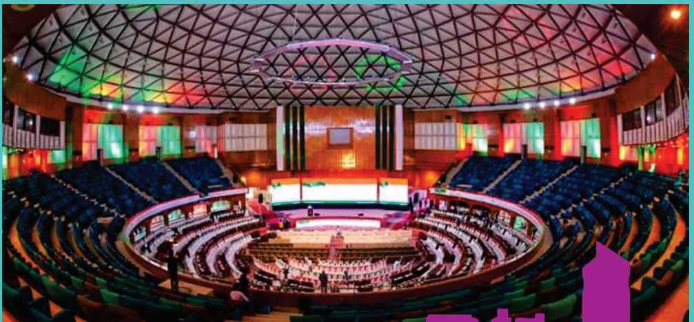
Jinnah Convention Center Islamabad, Pakistan

Pakistan Network of Quality Assurance in Higher Education was launched in the 1st International Conference on Quality Assurance in Higher Education, December 18-19 2017 organized by Khyber Medical University at Peshawar. In the conference, Quality Enhancement Cell of KMU proposed Pakistan Network of Quality Assurance in Higher Education to provide a platform to QECs of Pakistani HEIs which are established in 250 Universities. The proposal was accepted by almost all the participants from national and international HEIs. PNQAHE successfully achieved its goal and brought all QA professional of Pakistan on one platform by organizing 2 nd and 3 rd international conferences hosted by University of Lahore and Shah Abdul Latif University Khairpur Sindh. PNQAHE became regional partner of INQAHE. The practices of Quality Assurance need to be publicized, therefore, first time journal of Quality Assurance namely “Journal of PNQAHE” was launched in Pakistan and successfully issued 04 volume of Articles received and shared in the PNQAHE conferences.