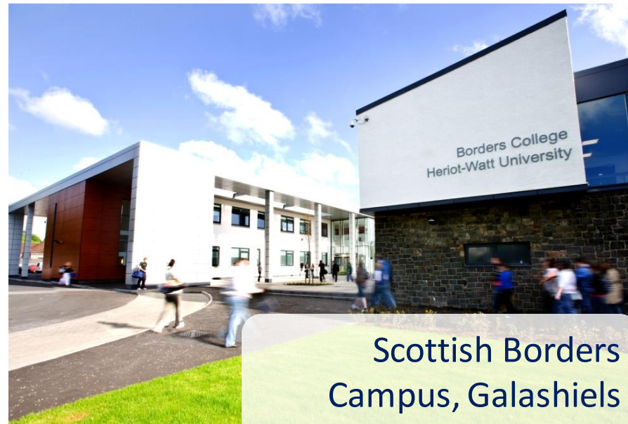
Scottish Borders Campus, Galashiels